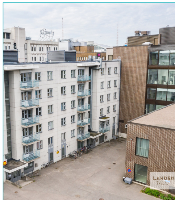
Vapaudenkatu 28, one of the buildings retrofitted using Energy Choice.

The project Energy Choice was developed on the idea of making the data available to citizens through an online platform that would guide them through the different energy choices available to them. For example, for local energy production, the different energy sources and potential savings are calculated by a specialised company that uses data provided by the city. The data sources used for the calculations come from buildings' energy consumption, the National Land Survey, the Geology Research Centre, and solar radiation. Using the city data, the types of energy sources calculated are: solar heat and